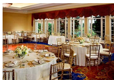
Marriott Inn Grand Ballroom